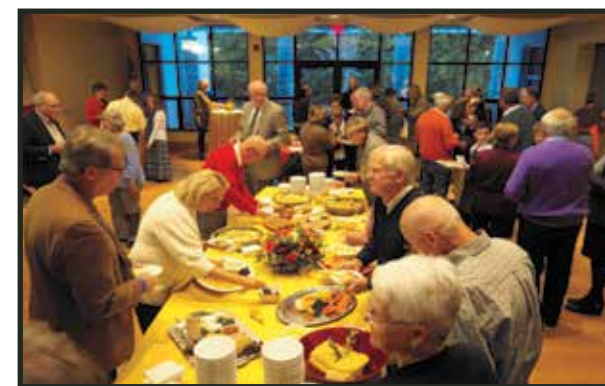
Donor Appreciation Party October 29, 2015

Litchfield Community Center depends on you, our donors, friends and neighbors, to help our programs carry on and grow. Your support is essential to the Center's financial health and helps drive our initiatives to serve the community's need and interests. As we move closer to the end of 2015 and look towards the future of the Community Center, we do so with optimism and purpose, and we count on our community members to contribute in helping us fulfill our mission. Your Community Center has a reputation for offering both high quality and a broad quantity of programs in a wonderfully equipped and clean facility. The Center is an incredible resource for people of all ages, as well as organizations and businesses, throughout the Northwest corner and beyond. You make this possible.